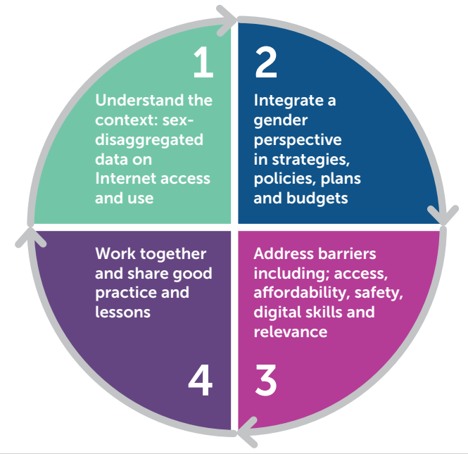
Figure 1: Recommendation areas